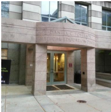
Tosteson Medical Education Center (TMEC), 260 Longwood Avenue, Boston, 02115